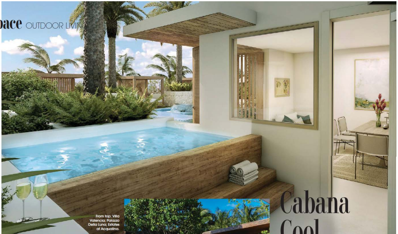
From top: Villa Valencia; Palazzo Della Luna; Estates at Acqualina.